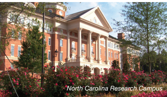
North Carolina Research Campus